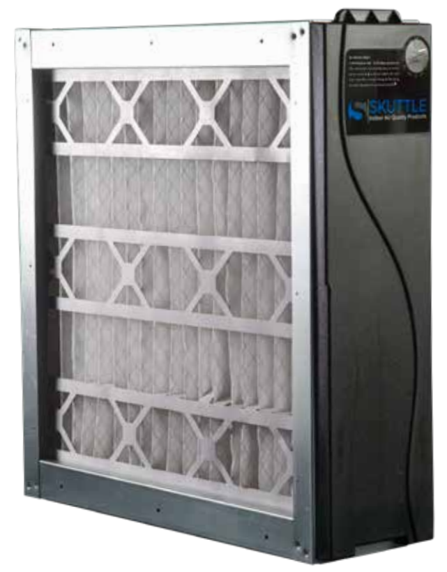
Also available, Skuttle's MERV 11 filter media captures in-home contaminants as small as ONE MICRON.

Indoor Air Quality Products www.skuttle.com Made in the U.S.A.